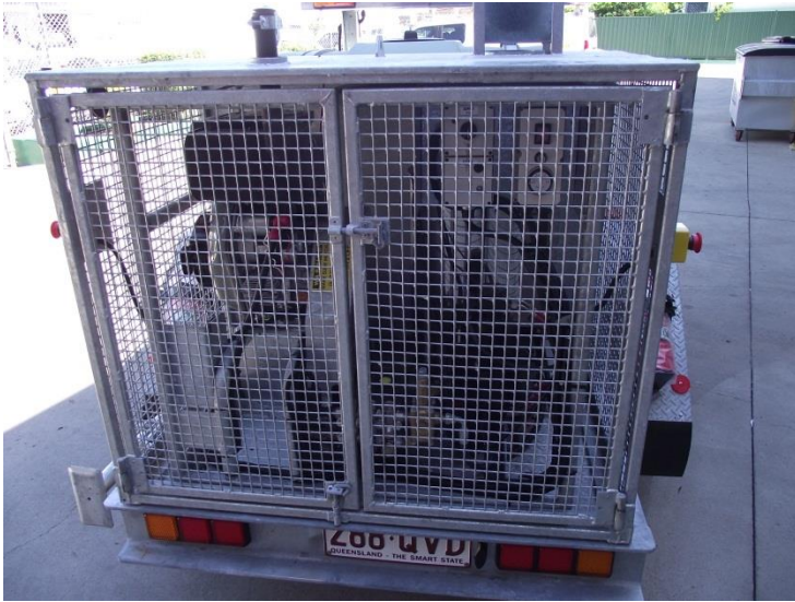
Pressure cleaner & Burner caged, E- Stops fitted outside